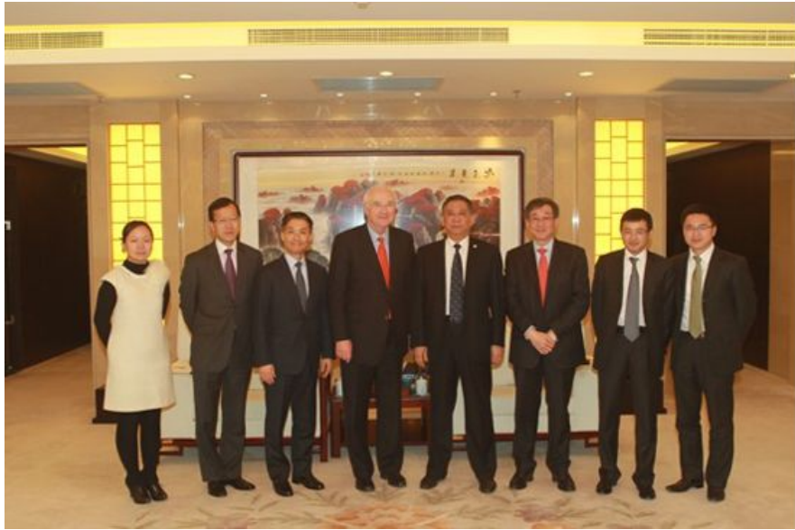
(A group photo)