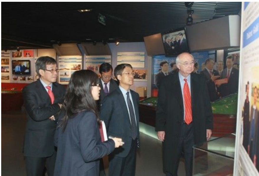
(Visiting the exhibition hall)