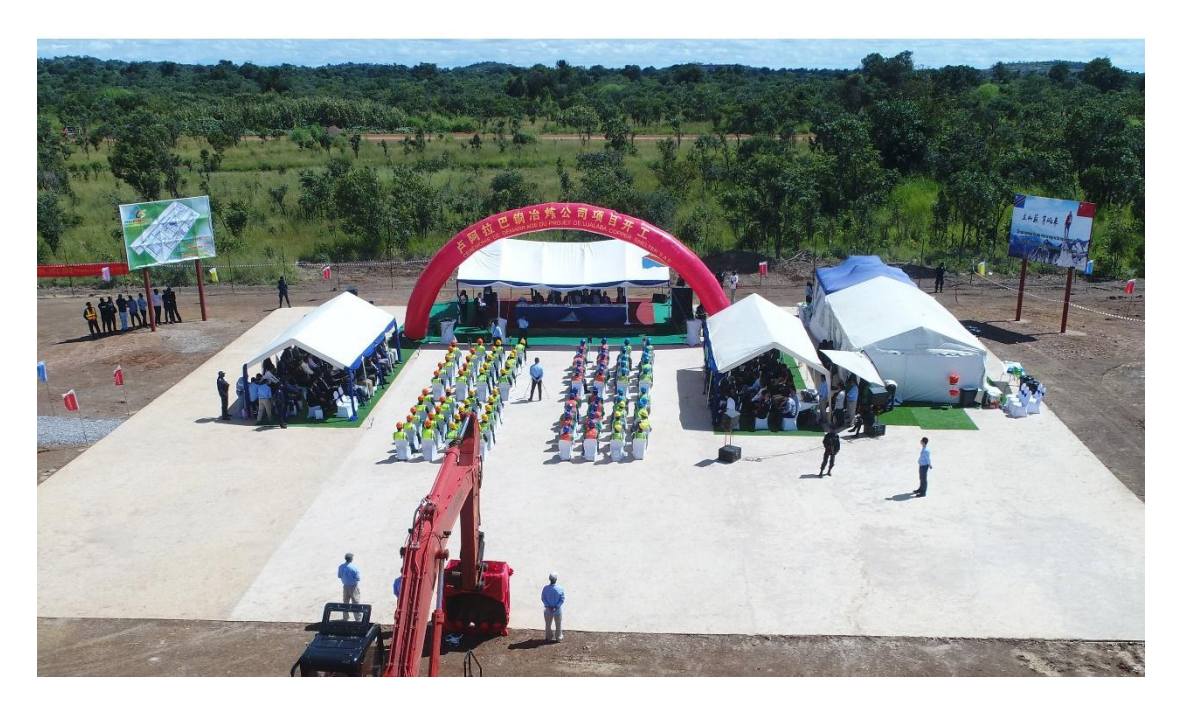
Site Photo for Mobilization Ceremony

---- Mobilization Ceremony for 400,000 Tons of Concentrate Crude Copper Project in Lualaba, Democratic Republic of the Congo