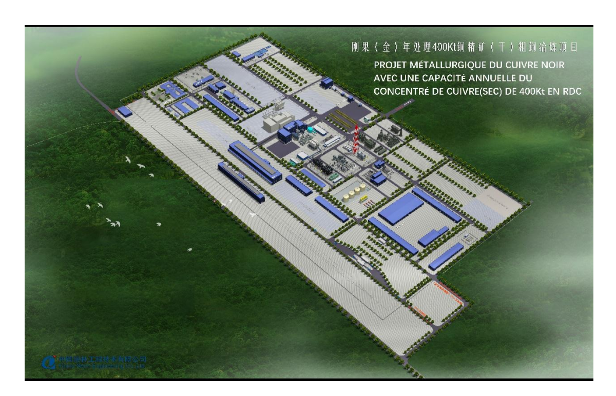
(Project Design Drawing)