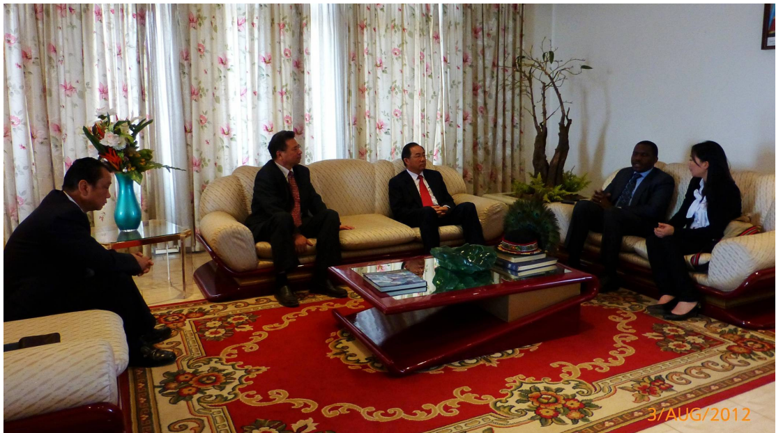
A deep and thorough exchange