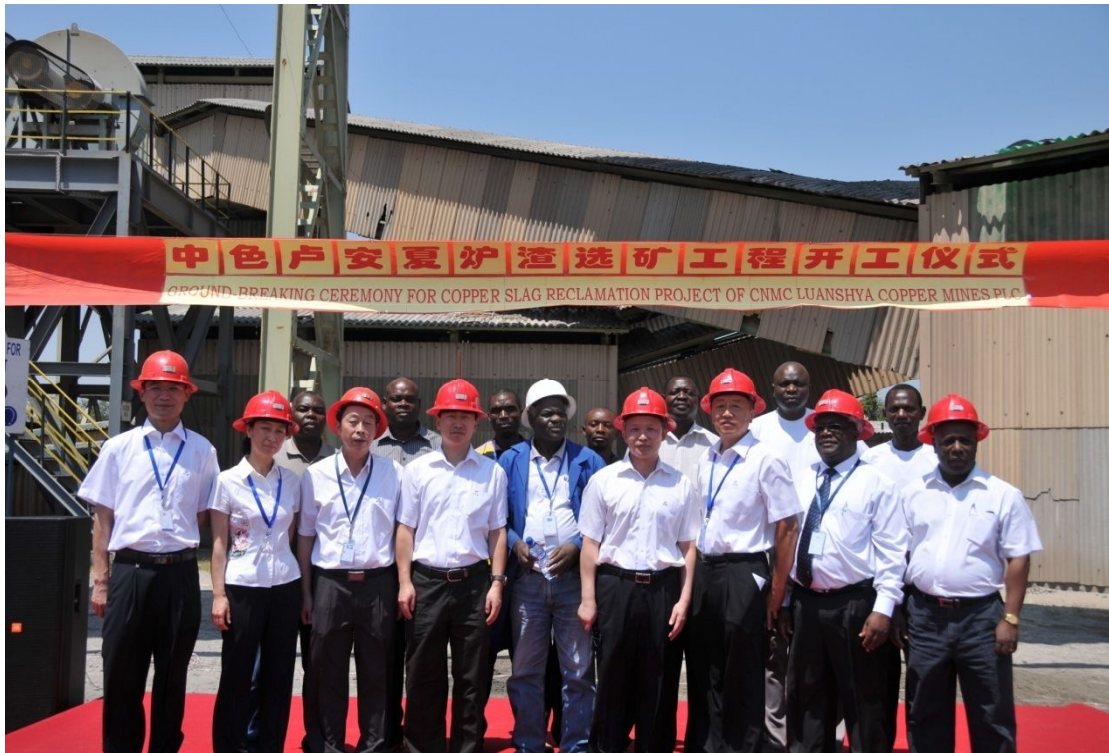
A group photo of CNMC Luanshya management members and union representatives