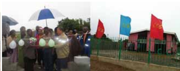
CCS donated residential houses for the physicians and nurses of local clinics