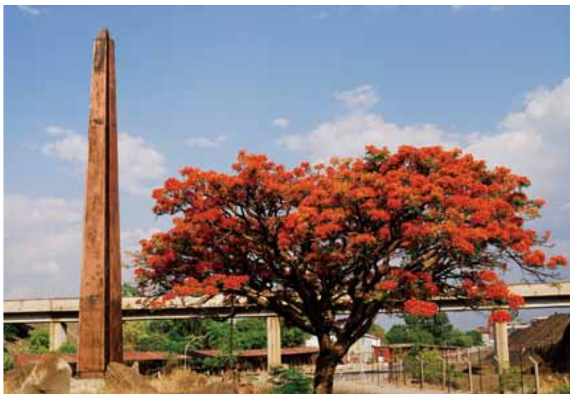
Monument for the discovery of the copper mine at Luanshya

As at 30 June 2013, the Group's bank loans had no seasonality features.