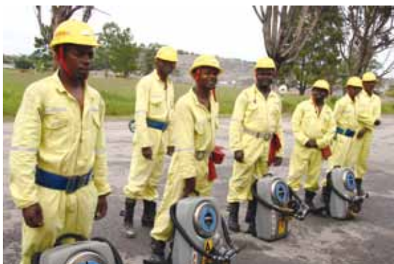
Mine emergency rescue team

The Group always value the strict and diligent performance of environmental laws. It aims to improve its management practices relating to safety and environmental protection through the continuous increase in investment in this respect. The Group highly values the relationship with its stakeholders and aspires to achieve a win-win cooperation. The Group will continue to fulfil its corporate social responsibility by contributing to the economy of the community and social development.