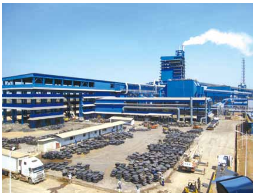
Blister copper products