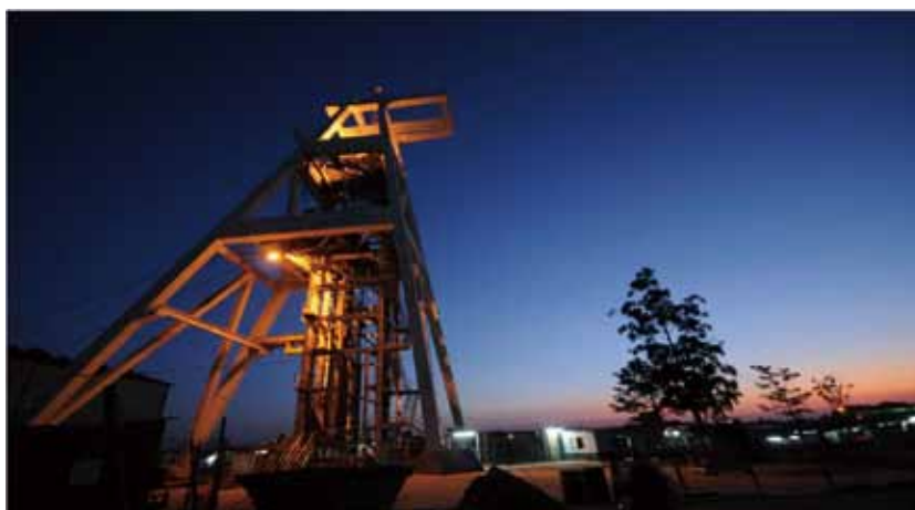
The main mine of Chambishi Copper Mine in daybreak

Computershare Hong Kong Investor Services Limited Shops 1712-1716, 17th Floor Hopewell Centre, 183 Queen's Road East Wanchai, Hong Kong