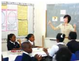
Chinese-language teaching volunteer in Luanshya trust school

From January to June 2013, the Group actively participated in local social welfare undertakings in Zambia through monetary fund and physical assets. It supported urban construction, constructed markets, provided language education, donated medicines, food and housing and benefited local municipal administration, education, medical treatment and public health and public welfare undertakings, which were highly appreciated by Zambian government and local residents and further established a good image for the Sino-Zambian economic cooperation model.