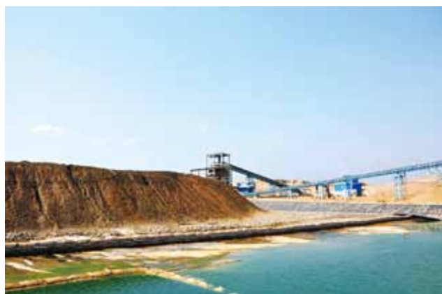
Leach solution from spray leaching of Muliashi Project