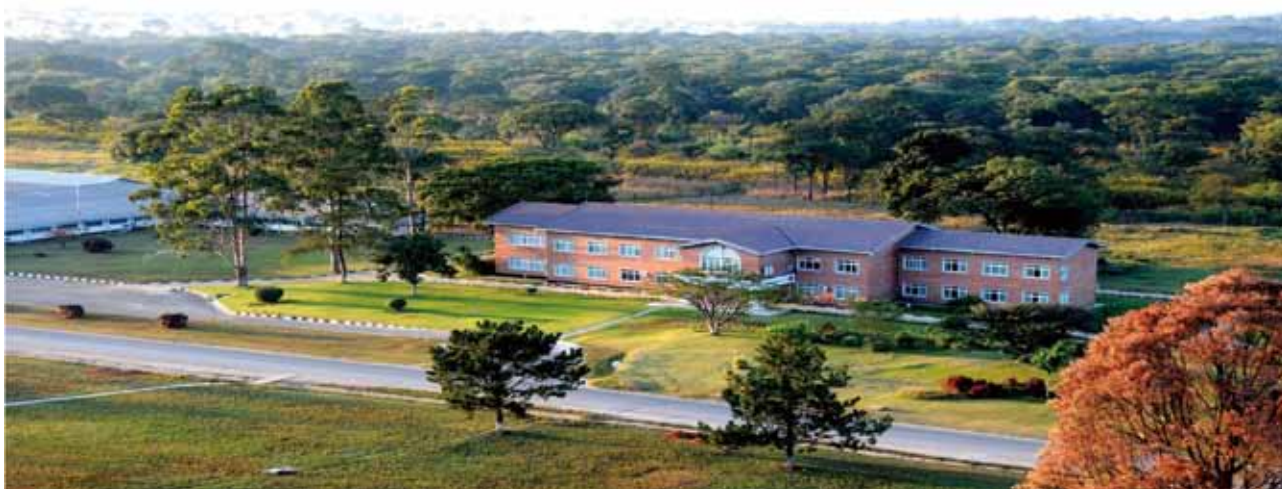
Central office building of NFA

During the reporting period, the Group promoted the establishment of a corporate chief legal consultancy system across the Company and subsidiaries. It also set up a department for legal and compliance matters, formulated the rules of procedure of the general meeting, the board of directors and the president office of China Nonferrous Mining Corporation Limited (《中國有色礦業有限公司股東大會、董事會暨總裁辦公會議事規則》), printed and published the Guidelines on Legal and Compliance Management of China Nonferrous Mining Corporation Limited (《中國有色礦業有限公司法律與合規管理工作指引》), and improved the management system of information disclosure and tracking and management procedures of related party transactions. It also designated company lawyers to organize specific trainings for all Directors, senior management and compliance personnel in respect of compliance items. All these measures improved corporate governance.