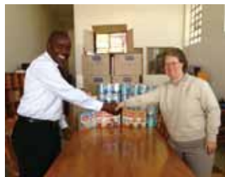
Luanshya donated food to the local babies