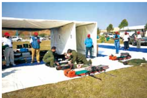
Management members of NFCA participated in the mine rescue drill competition