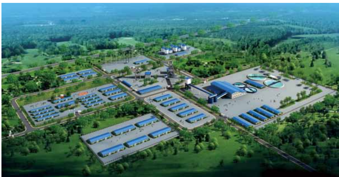
Bird's-eye view of mining and processing engineering of Chambishi Southeast Mine

The Group will pay attention to improving its working environment, further enhance ability in human resources management and strengthen staff training to provide guarantee for safe and efficient production.