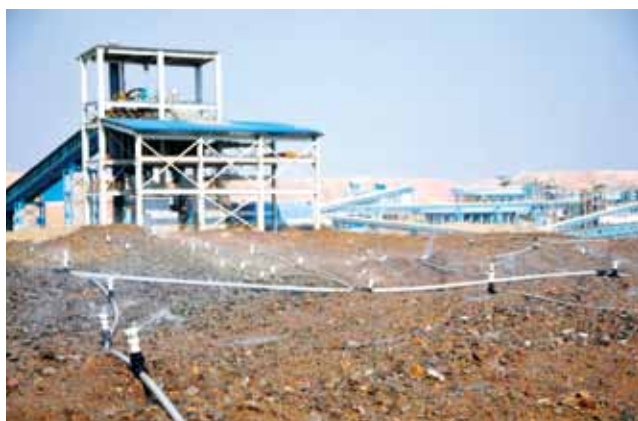
Spray leaching operations in the No.1 stockpile of heap leaching system of Muliashi Project

With regard to the Muliashi Project, its agitation leaching system has commenced production. In the second half of the year, focus will be put on the testing of the production system in the heap leaching system and the improvement of production. Phase II of the expansion project of CCS will, upon the expected completion of overall construction before the end of the year, bring the production capacity of the Company's blister copper to a new level. The Company will strive to complete the construction of Mabende Leach Project in the second half of 2013, and complete the development of slag copper recovery project in 2014. It will also advance the development of Mwambashi Mine and Chambishi Southeast Mine.