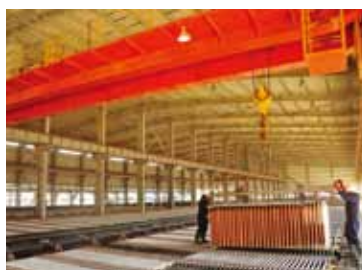
Electrode workshop of Muliashi Project