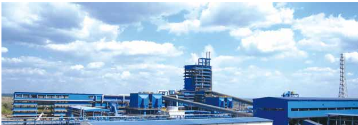
Panorama of the plant of CCS

The revenue from sulfuric acid decreased by 21.0% from US$37.1 million in the first half of 2012 to US$29.3 million in the same period of 2013, primarily attributable to the fact that (1) in order to use the resources of the Group more efficiently, more sulfuric acid was supplied for the internal use of Muliashi Project in the first half of 2013; the sulfuric acid sold outside the Group decreased by 4.5% from 195,497 tonnes in the first half of 2012 to 186,764 tonnes in the first half of 2013; and (2) a decrease of 17.4% in average selling price of sulfuric acid of the Group from US$190 per tonne in the first half of 2012 to US$157 per tonne in the first half of 2013.