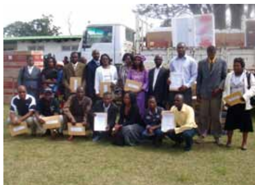
The outstanding employees of Luanshya were awarded testimonials and prizes on Labour Day