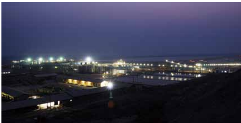
Night view of Muliashi Project

The cash inflows from financing activities primarily consist of new bank and other borrowings as well as proceeds from increase in capital. The cash outflows from financing activities primarily consist of repayments for bank and other borrowings, dividend payments and interest payment. The net cash flows generated from financing activities of the Group increased by 24.4% from US$155.0 million in the first half of 2012 to US$192.8 million in the same period of 2013. The increase in cash flows generated from financing activities was primarily attributable to the increase in bank loans of the Company in the first half of 2013 as compared with the same period in the previous year.