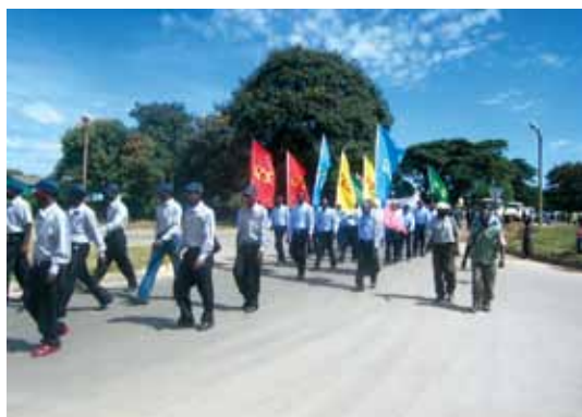
Employees of CCS participated in the Labour Day parade

As of 30 June 2013, the Group employed a total of 6,308 employees (as of 30 June 2012: 6,194), which comprised 520 Chinese and 5,788 Zambians. The total cost of employees reflected in the condensed consolidated statement of profit or loss and other comprehensive income amounted to US$46.2 million for the six months end 30 June 2013 (for six months ended 30 June 2012: US$40.2 million). The increase in the cost of employees was attributable to the increase in the number of employees due to expansion of production scale and the growth in average salaries.