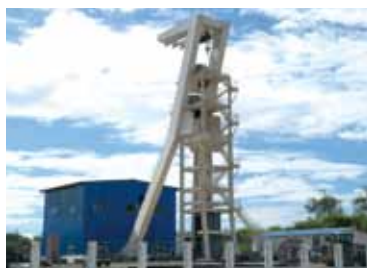
Central auxiliary shaft of the west mine of Chambishi Copper Mine

From January 2013 to June 2013, copper contained in concentrate produced by the Chambishi Main Mine and Chambishi West Mine amounted to 13,019 tonnes, representing an increase of 3.3% over the same period in the previous year. Such increase in production volume was primarily attributable to the increase in the production volume of Chambishi West Mine.