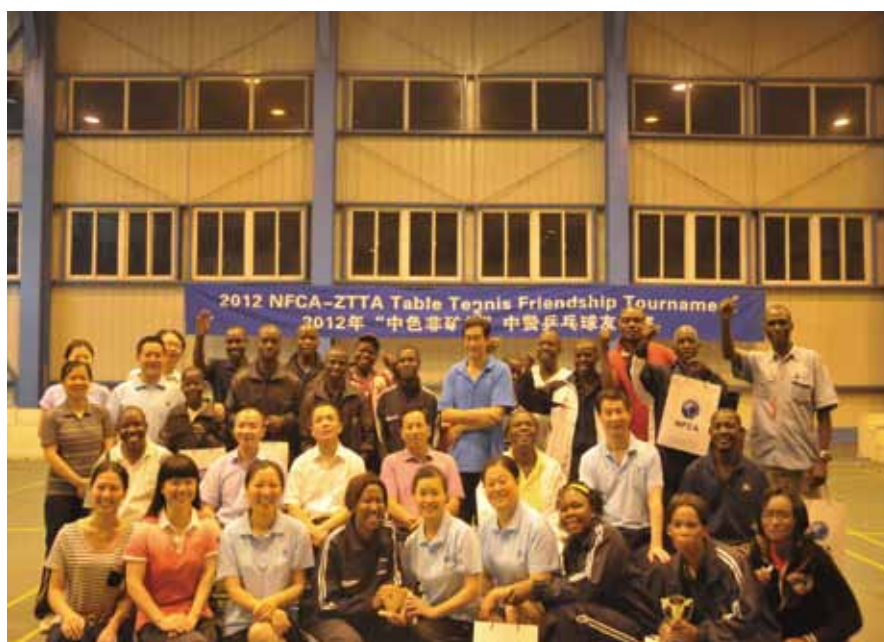
NFCA's Sino-Zambian Table Tennis Friendly Match