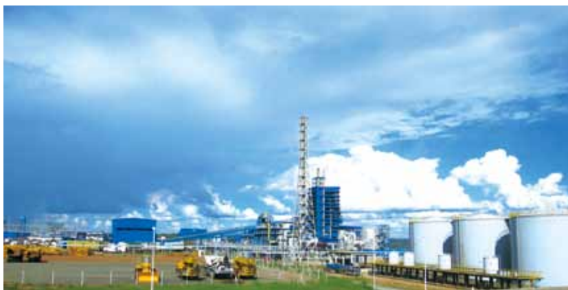
Panorama of CCS

The total capital expenditure of the Group decreased by US$7.9 million from US$133.3 million for the first half of 2012 to US$125.4 million for the first half of 2013. During the reporting period, the capital expenditure of the Group was primarily used in projects such as the Chambishi Southeast Mine Project, Muliashi Project, phase II of expansion of CCS copper smelting and Mabende copper smelting by leaching.