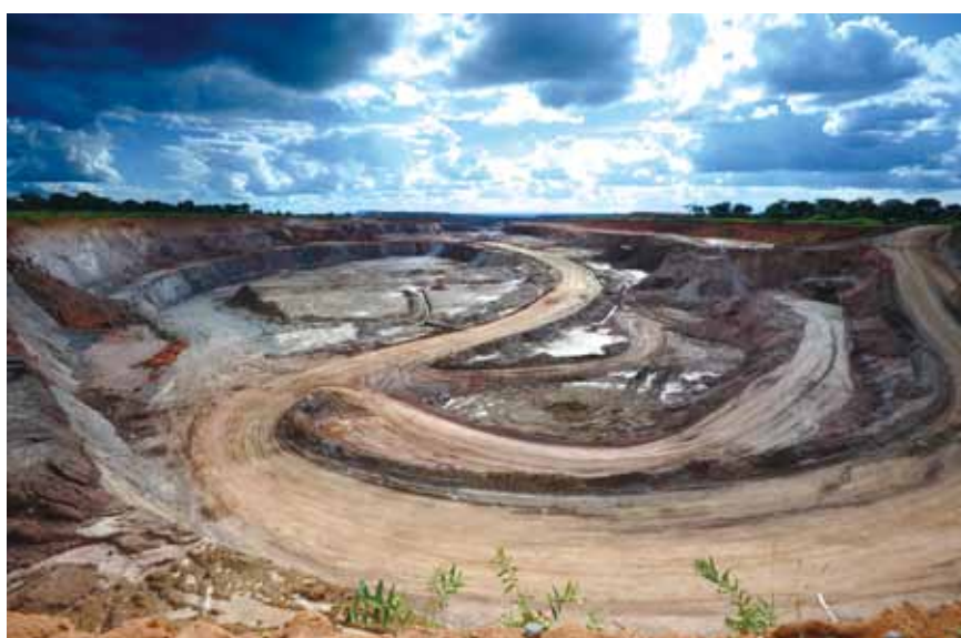
Surface mine of Muliashi Project

The remaining balance of the net proceeds has been placed in interest bearing deposit accounts with banks.