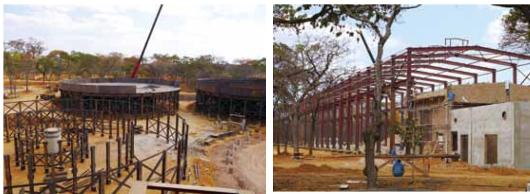
Construction site of the leaching copper project at Mabende

In February 2013, the Group completed the environmental impact assessment and resources check of Mwambashi Mine through drilling. Currently, further survey and review of the project is underway.