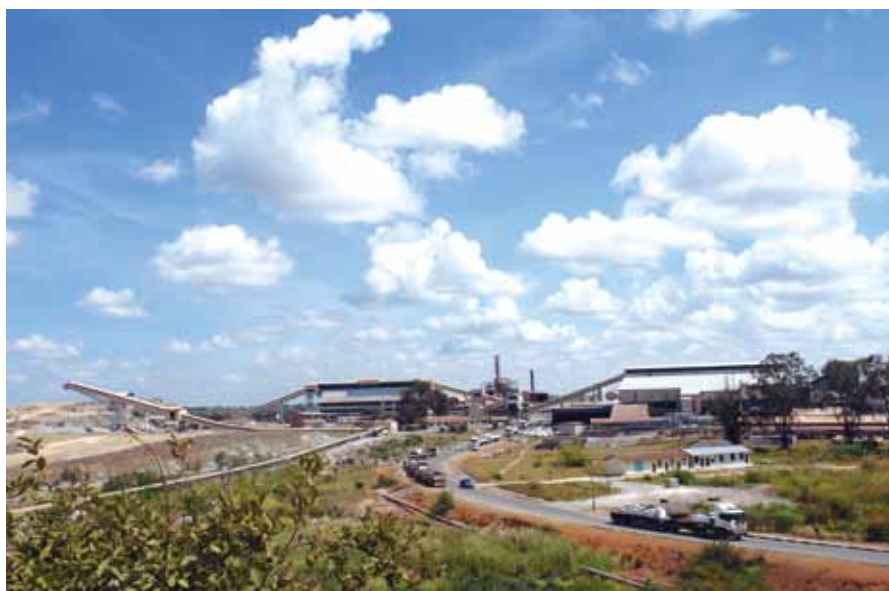
Panorama of the ore processing plant of Chambishi Copper Mine