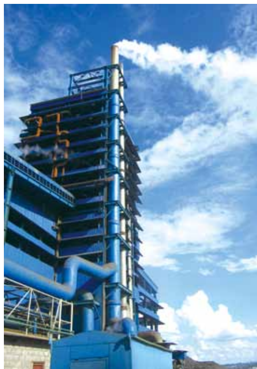
Isa furnace of CCS

The trade payables of the Group decreased by US$8.0 million from US$192.1 million as at 31 December 2012 to US$184.1 million as at 30 June 2013.