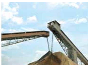
Ore unloading operations of the main mine and the west mine of Chambishi Copper Mine