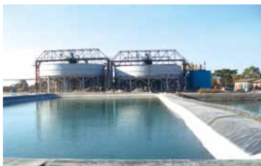
Settling pond for leaching

attributable to the fact that this project commenced production from February last year and its output did not meet the production target.